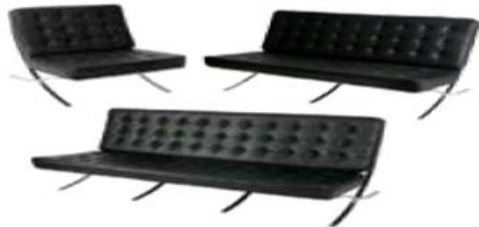
C-SS-24 Barcelona Black Sofa (3 seater) C-SS-25 Barcelona Black Sofa (2 seater) C-SS-26 Barcelona Black Single Chair