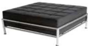
C-SS-68 Square, No Back Ottoman, black