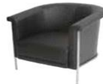
C-SS-8 Black Leather Round Back Tub Chair