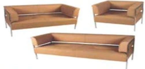
C-SS-54 Stronco Open Back Sofa, sand (3 seater) C-SS-55 Stronco Open Back Sofa, sand (2 seater) C-SS-56 Stronco Open Back Single Chair, sand