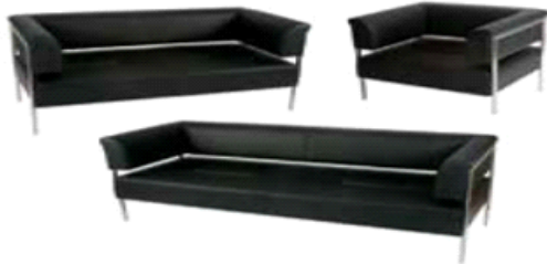
C-SS-48 Stronco Open Back Sofa, black (3 seater) C-SS-49 Stronco Open Back Sofa, black (2 seater) C-SS-50 Stronco Open Back Single Chair, black