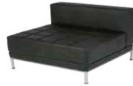
C-SS-67 Square Back, Single Chair, black