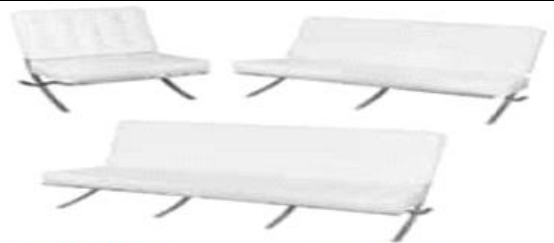
C-SS-28 Barcelona White Sofa (3 seater) C-SS-29 Barcelona White Sofa (2 seater) C-SS-30 Barcelona White Single Chair