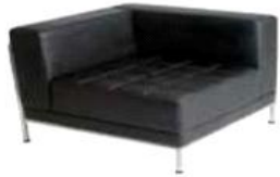
C-SS-66 Square, L-shaped Back Single Chair, black